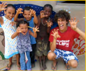
Alyn Hospital in Jerusalem