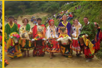
Blue Sparrow NGO in Huancayo, Peru