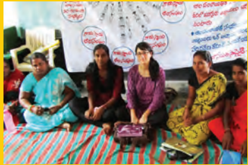
B'Tzedek -LIFE, Hyderabad, India