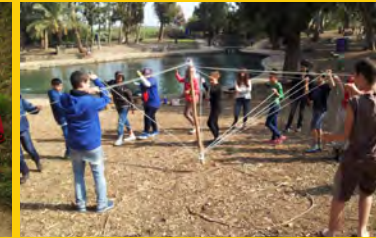
Good Water Neighbours Youth Camps