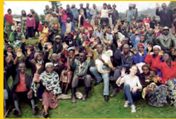
Spark MicroGrants, Rwanda & Uganda